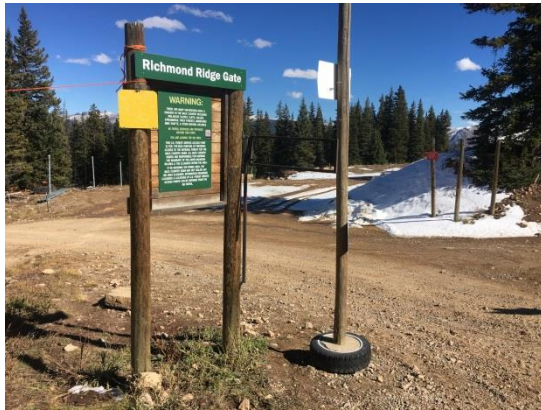
Gate leaving the Aspen ski area, behind the top of the gondola.